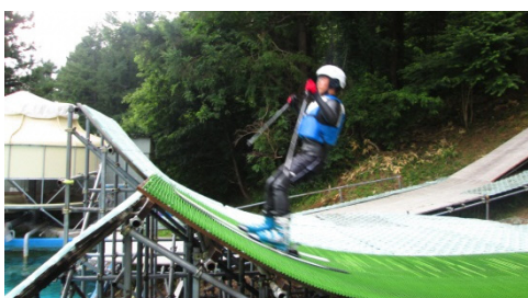
③From the steep ramp, the skier flies high into the air to perform aerials.