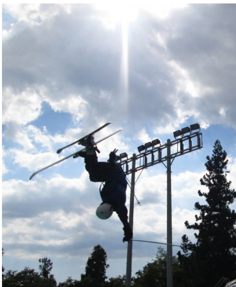
④Using complicated moves, the skier completes a total of 1080 degrees rotation.