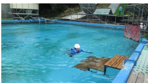
⑥Swimming with skis on requires skill.