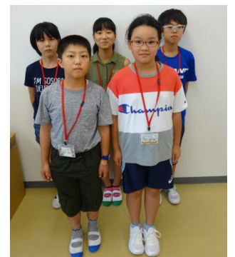
The five members of Group 5