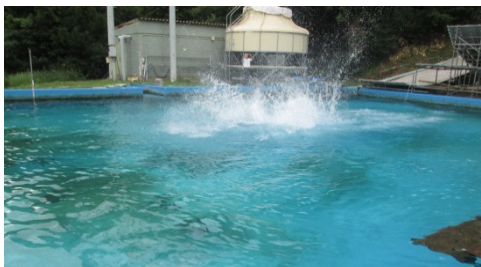
⑤The skier lands in the pool with a big splash.