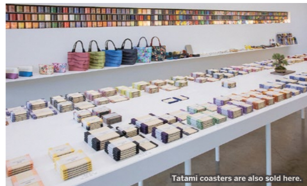
Tatami coasters are also sold here.

Kuboki Tatami, which was founded in the Edo period, has renovated its head office and factory and opened an "interactive tatami experience facility". The facility was designed to provide a space where people who do not own tatami can touch and feel authentic tatami mats. Visitors can observe the actual production site, enjoy an exhibition of the history of tatami, experience the craftsmanship of tatami making, and experience the vision of "Kuboki Tatami" as it takes on the challenge of "passing tatami on to future generations" and "spreading tatami around the world". It aims to establish a center for the distribution of "Made in Japan" tatami mats. Inside the store, visitors can enjoy workshops and relaxing in the cafe.