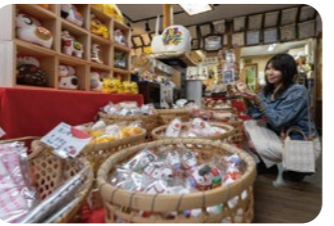
In addition to Miharu-koma, masks, and zodiac signs, the Mame-daruma dolls (8 colors) are also popular, with different colors offering different benefits.