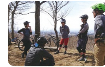
The trail offers a variety of routes within the 6-km-long course, which can also be looped around.