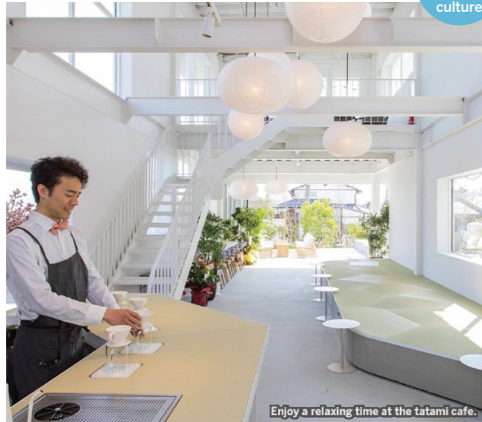
Enjoy a relaxing time at the tatami cafe.