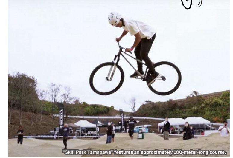
"Skill Park Tamagawa" features an approximately 100-meter-long course.