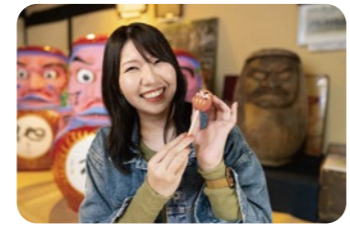
Mixing the paints to your favorite color on a palette is also fun. A cute Mame-daruma doll can be completed in about 20 minutes!