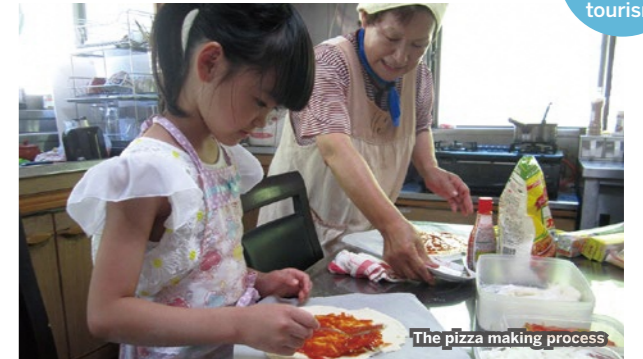
The pizza making process