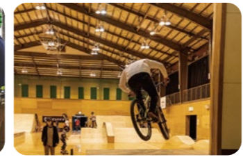
"Urban Sports Tamakawa" offers mini-runs, bank-to-banks, quarters, etc.