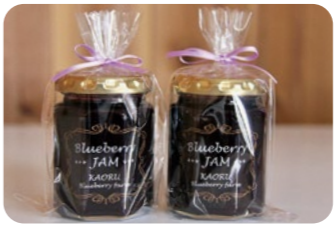
Additive-free, color-free, and preservative-free jams and fruit juice drinks with an irresistible pulpy texture, as well as miscellaneous goods, are also on sale.