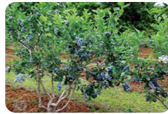
24 kinds of blueberries are grown in the orchard, including sweet, large, and sour varieties.